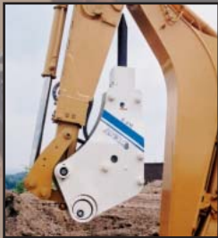
KF 6 SS

Switch Hitch mounting allows for greater "tuck" for loading, unloading and transport.